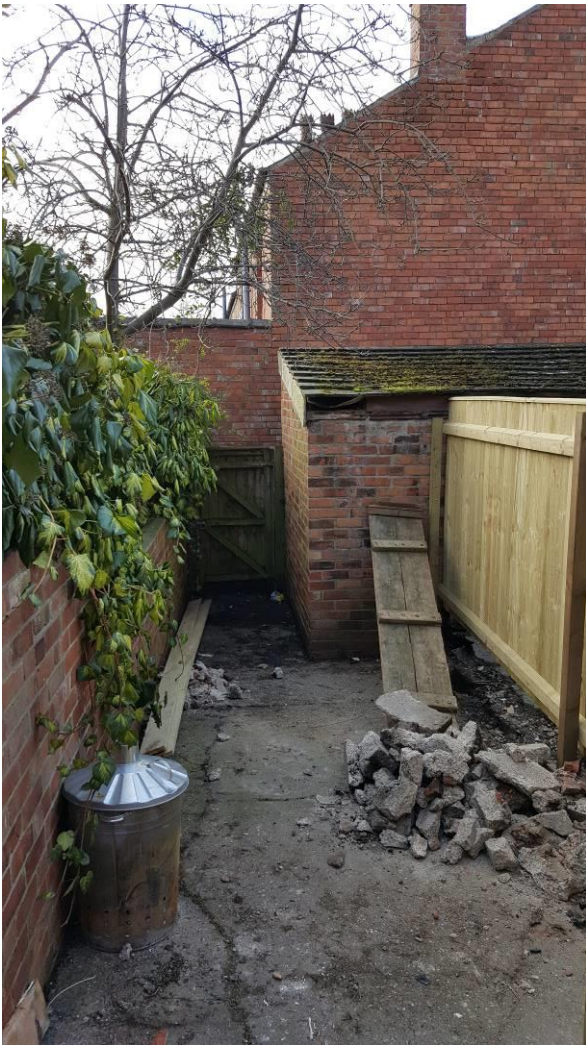
Left: Officer Photo of view south within the yard area, proposed to serve the HMO and flat at No. 235 Monks Road, towards No. 1 Coleby Street. The new fence is positioned to the right of the image.