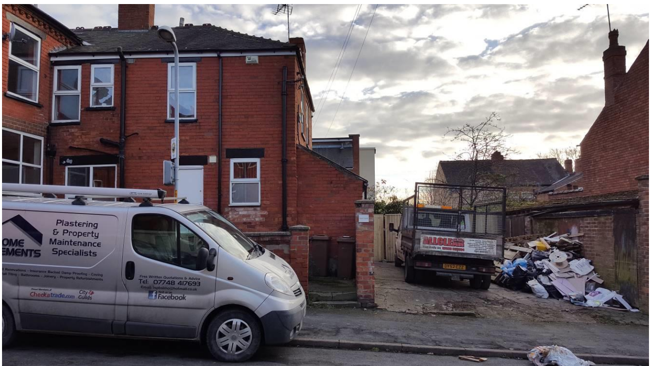
Officer photo of rear section of western elevation of No. 233 Monks Road, facing Coleby Street, encompassing the altered rear yard to Nos. 233 and 235 Monks Road. The outbuildings to the right form the southern boundary of both properties to No. 1 Coleby Street.