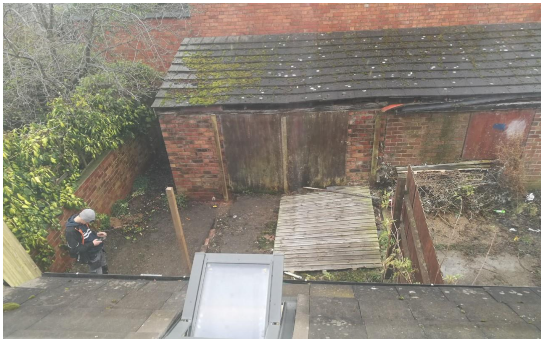
Applicant Photo taken looking down into yard before works commenced to rear yard