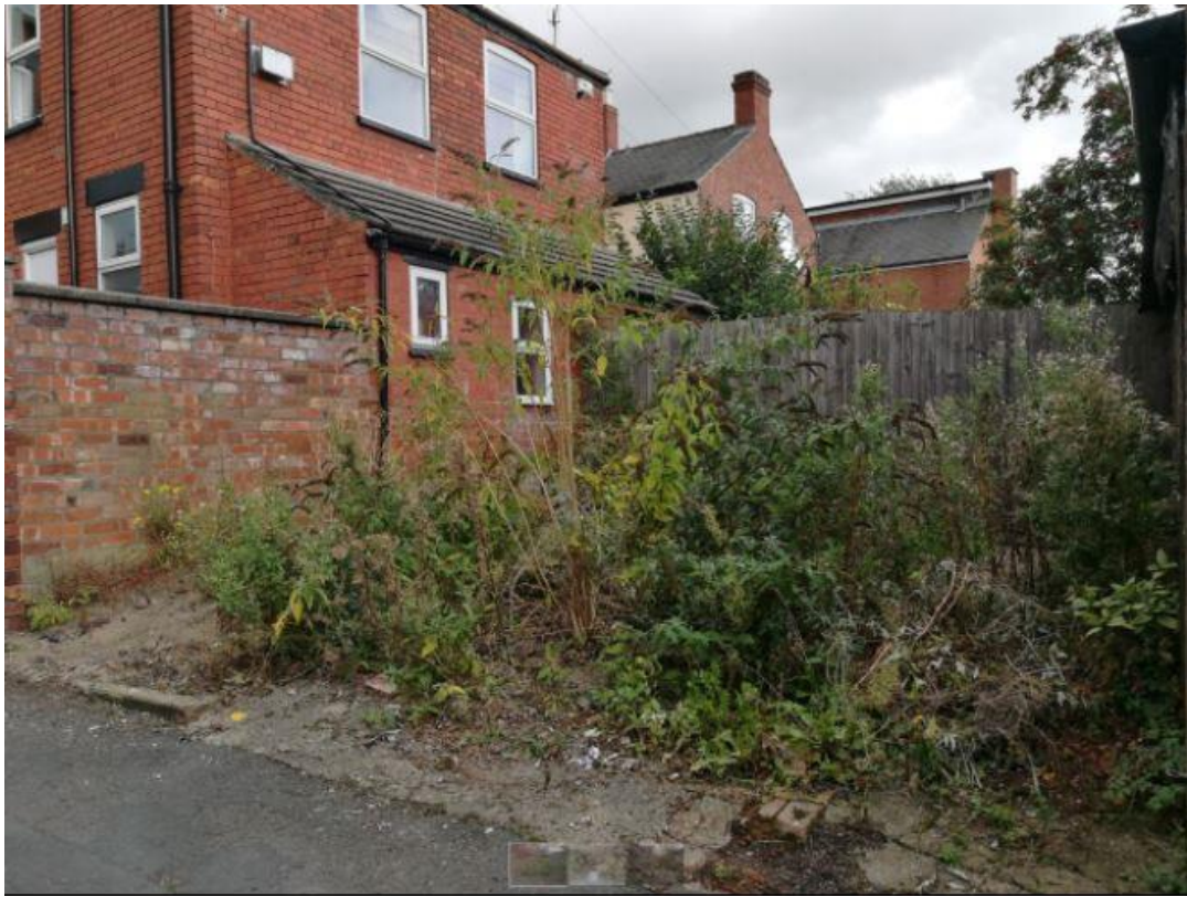
Applicant Photo taken before works commenced to rear yard.