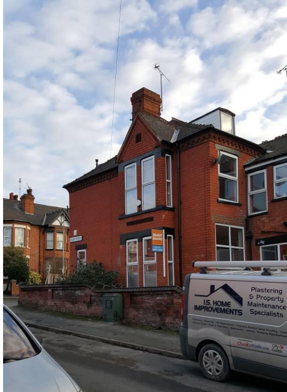
Front section of the western elevation of No. 233 Monks Road, facing Coleby Street.