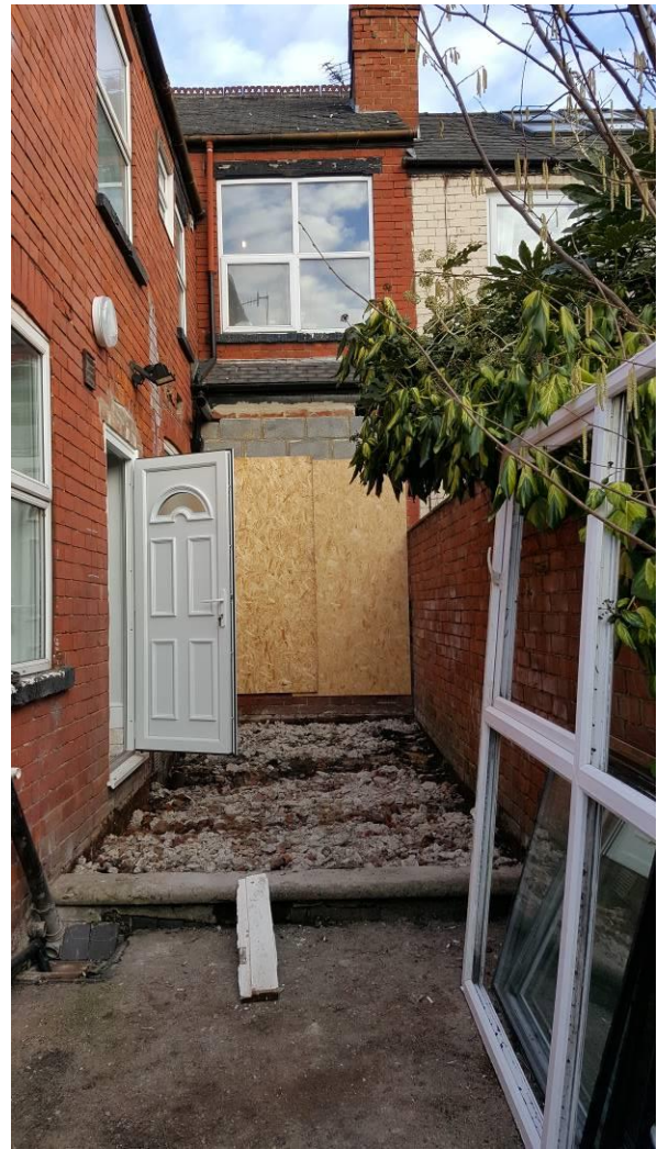
Right: Officer Photo of view along western elevation of rear projection (which would incorporate the proposed flat); the doors into the HMO are shown boarded over.